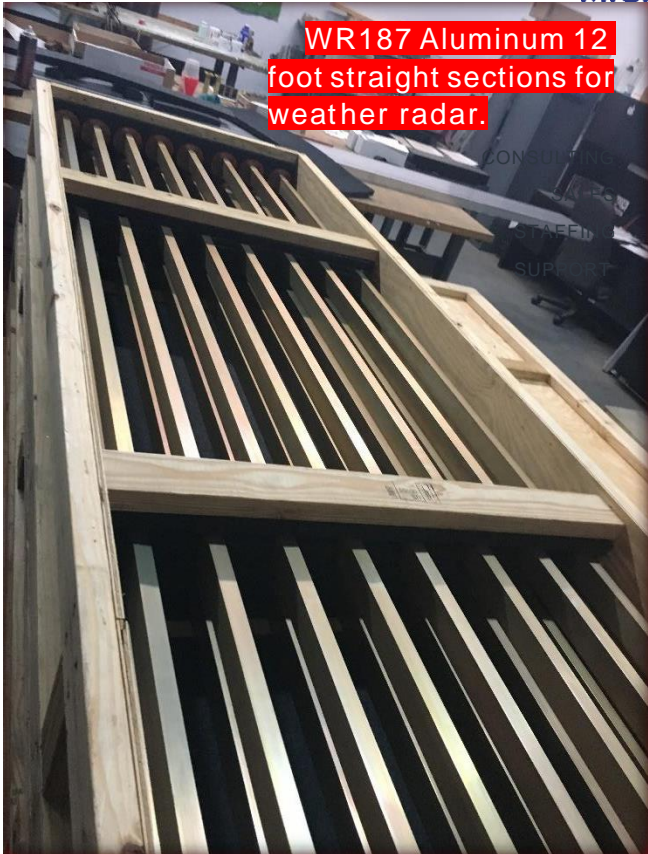
WR187 Aluminum 12 foot straight sections for weather radar.