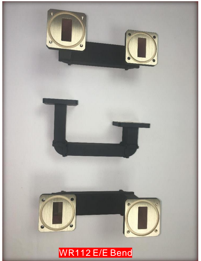
WR112 E/E Bend