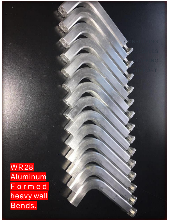
WR28 Aluminum Formed heavy wall Bends.